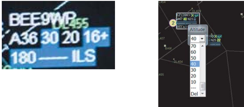
Figure 1.3: Commanded Values Integrated into the Radar Label (left) and menu structure for mouse input of an altitude value (right)

nizer (ASR) uses context knowledge about the current situation from a controller assistant system. This enables prediction of the next most probable commands and reduces the search space for the speech recognizer. With this technique, the AcListant® project achieved command error rates below 1.7% [6]. An ASR system with this level of accuracy is feasible for operational use even in the safety-critical air traffic control (ATC) domain. ATCos need to correct the automation only in very few cases. Hence, ATCos' concentration can remain on their main tasks. Furthermore, less time, spent for subordinate tasks, produces free cognitive resources for increasing air traffic demand.