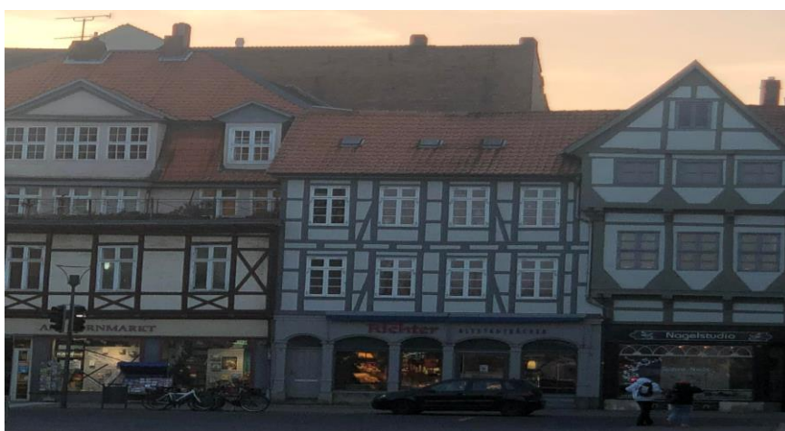
• Wolfenbottle town

The Partnership held the inaugural meeting of the Digi-Lance4SE Project in Wolfenbottle in January 2022.